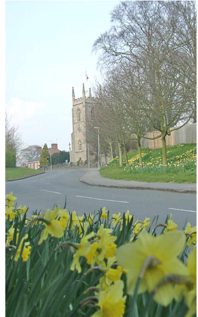
Village Heritage Trail